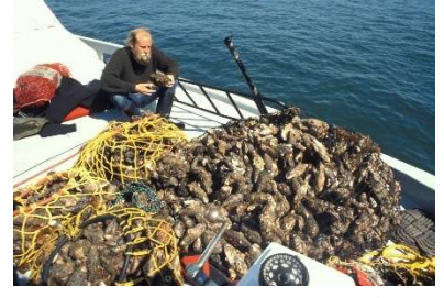
Our first mussel harvest

We received a Federal Grant to conduct a feasibility study to can mussels harvested from Platform Hilda, removed in 1997. When the "H" Platforms, Hilda, Hope, Heidi and Hazel, were removed, I was too busy with my businesses to participate in the decision-making process. With the removal of their jackets, the steel structure, around 4,000 tons of marine life, a 40-year old, multi-generational marine community was dumped in a land fill in Long Beach.